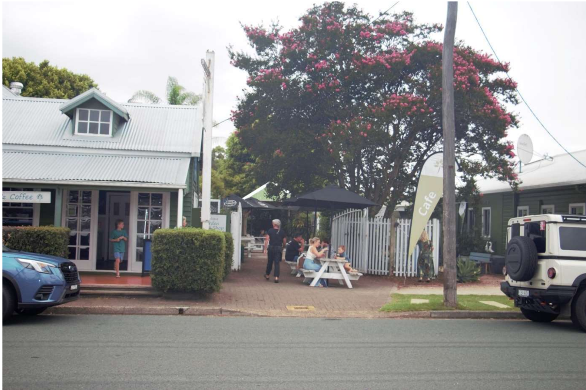
A popular spot to catch up with friends

We acknowledge the traditional custodians of the land on which we live and pay our respects to elders' past, present and future.