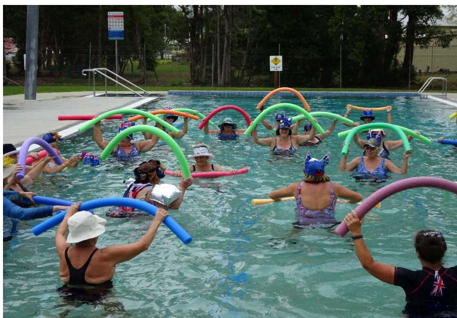
An aqua aerobics session at the Nabitac pool

Nabitac has a unique village atmosphere, with shops for vintage and collectables, gifts, and an art gallery. It's also home to the highly regarded National Motorcycle Museum. Some wonderful delicacies are produced in the area and sold in local outlets. There is a hotel and liquor outlets; a range of eateries within both the town and along the Highway corridor; motel accommodation; B & B's; self-contained cabins or farm stay. The nearest caravan park is at Failford. Many caravanners pull up to use the shopping area. The bakery is popular and there are picnic tables and seating near the shops. There are vehicle and caravan repairs, caravan sales, 24-hour fuel, EV charging, sports fields, a skate park, swimming pool and exercise groups indoors and in the park.