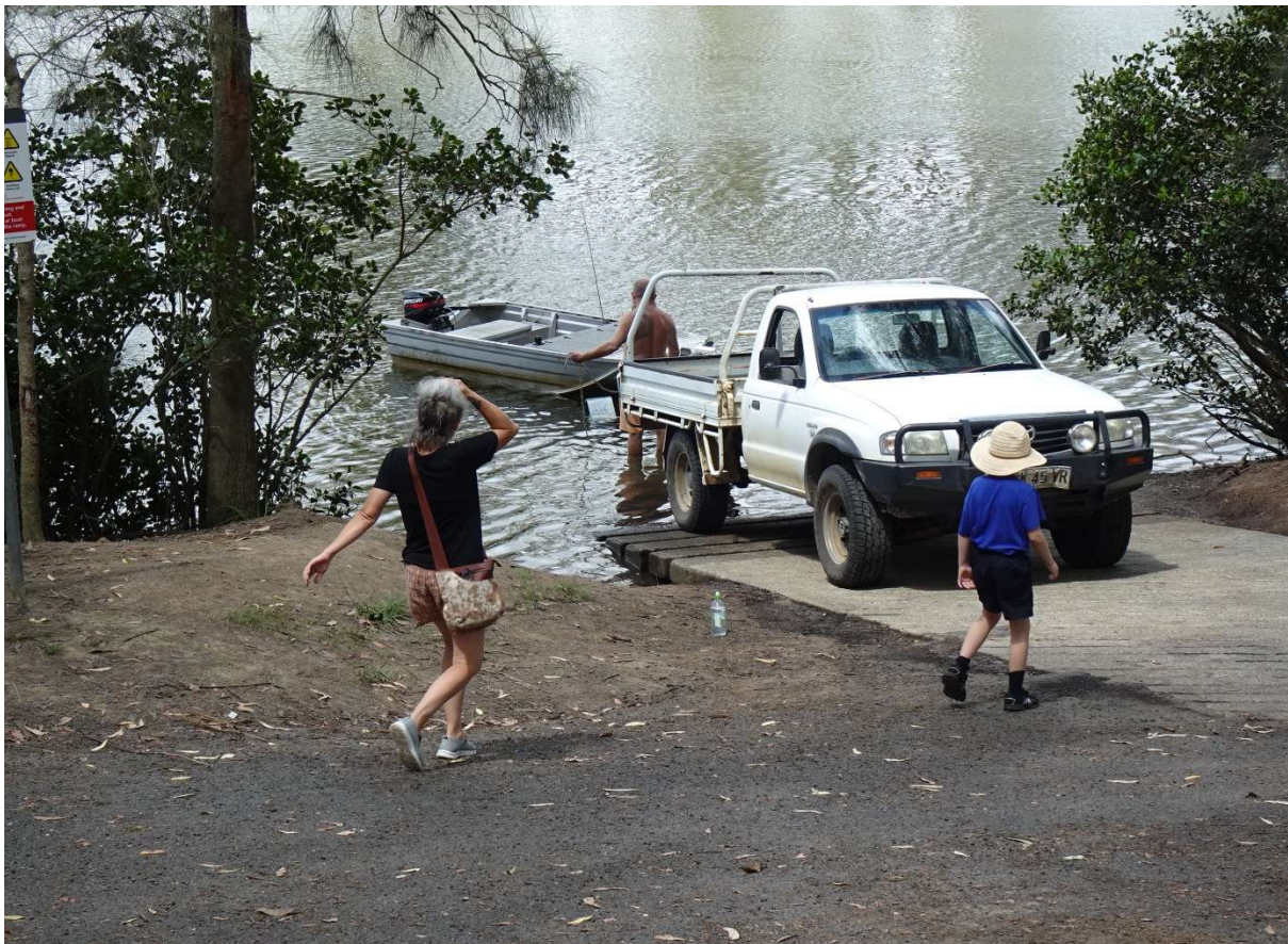
Launching into the Wallamba River