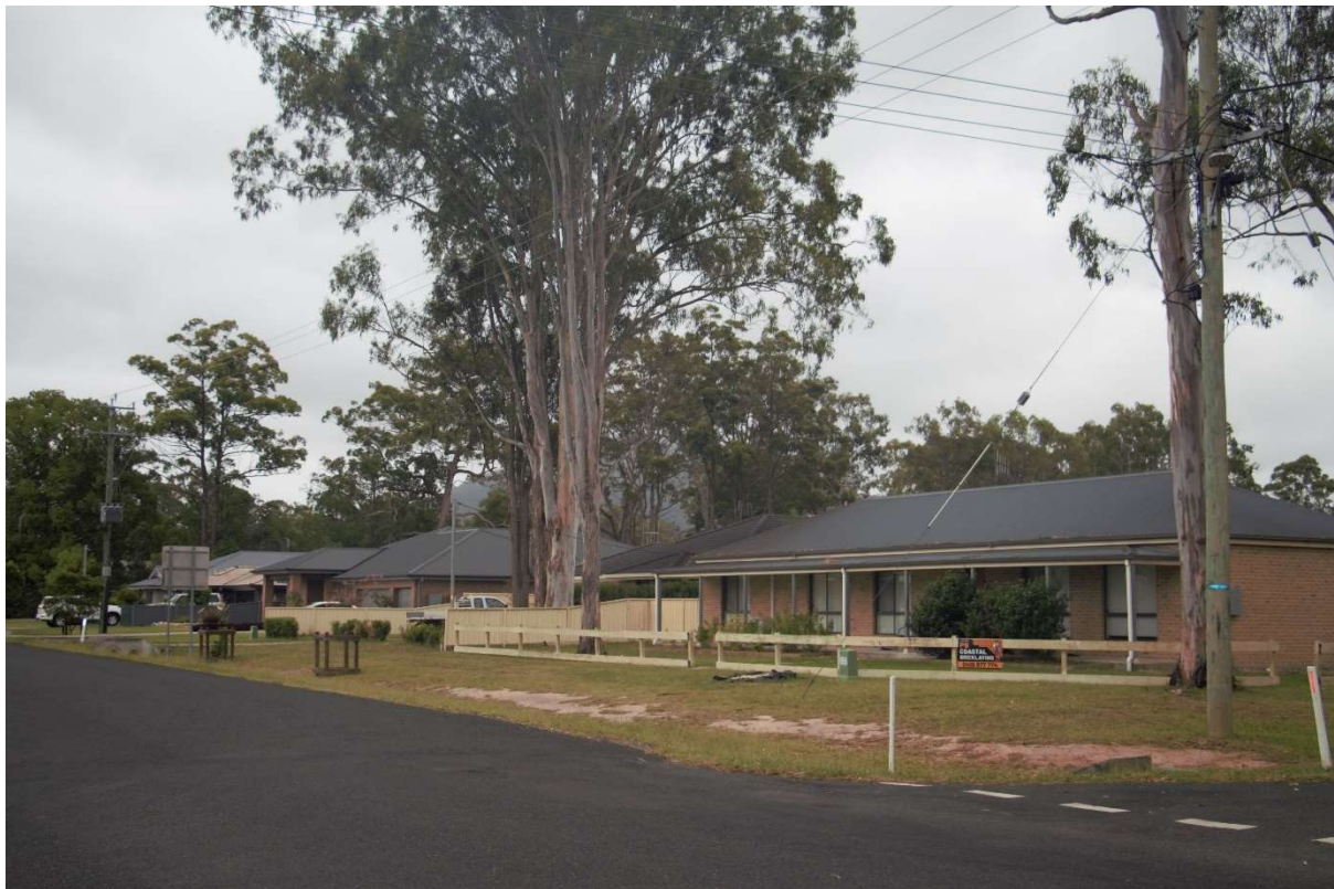
Sustainable development of housing

Retirees and families from the cities seeking a healthier lifestyle are attracted by the village environment, close-proximity to the river, beaches and bushland, along with easy access to the Highway for business and pleasure activities. The community sees the benefits of planning for an environmentally sustained economic expansion, while maintaining the village ambience. Forward planning is vital for Nabiac over the next few years as it continues to be a well sought out location and a delightful place to live.