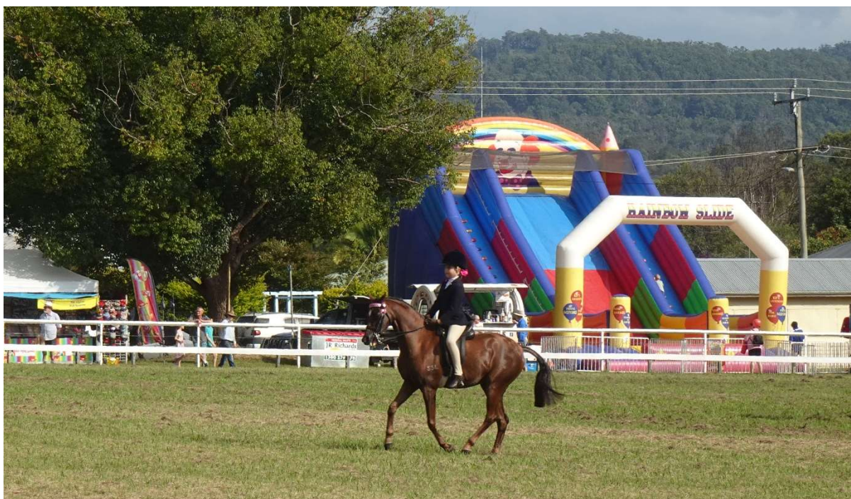
Skill and Fun at the Wallamba District Show