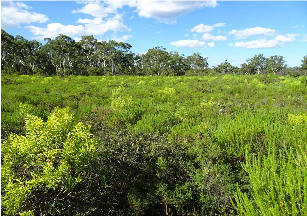
Wildflower trails in the spring