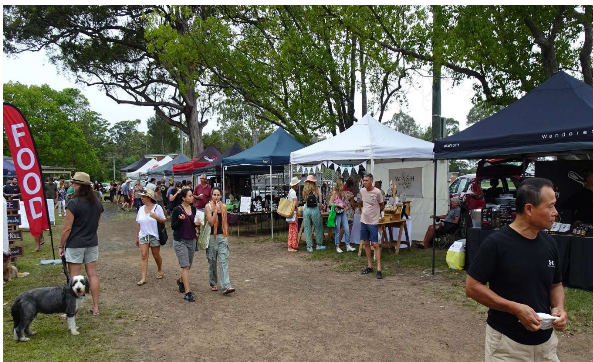
Nabiac Farmers Market : “Locally made, baked and grown”