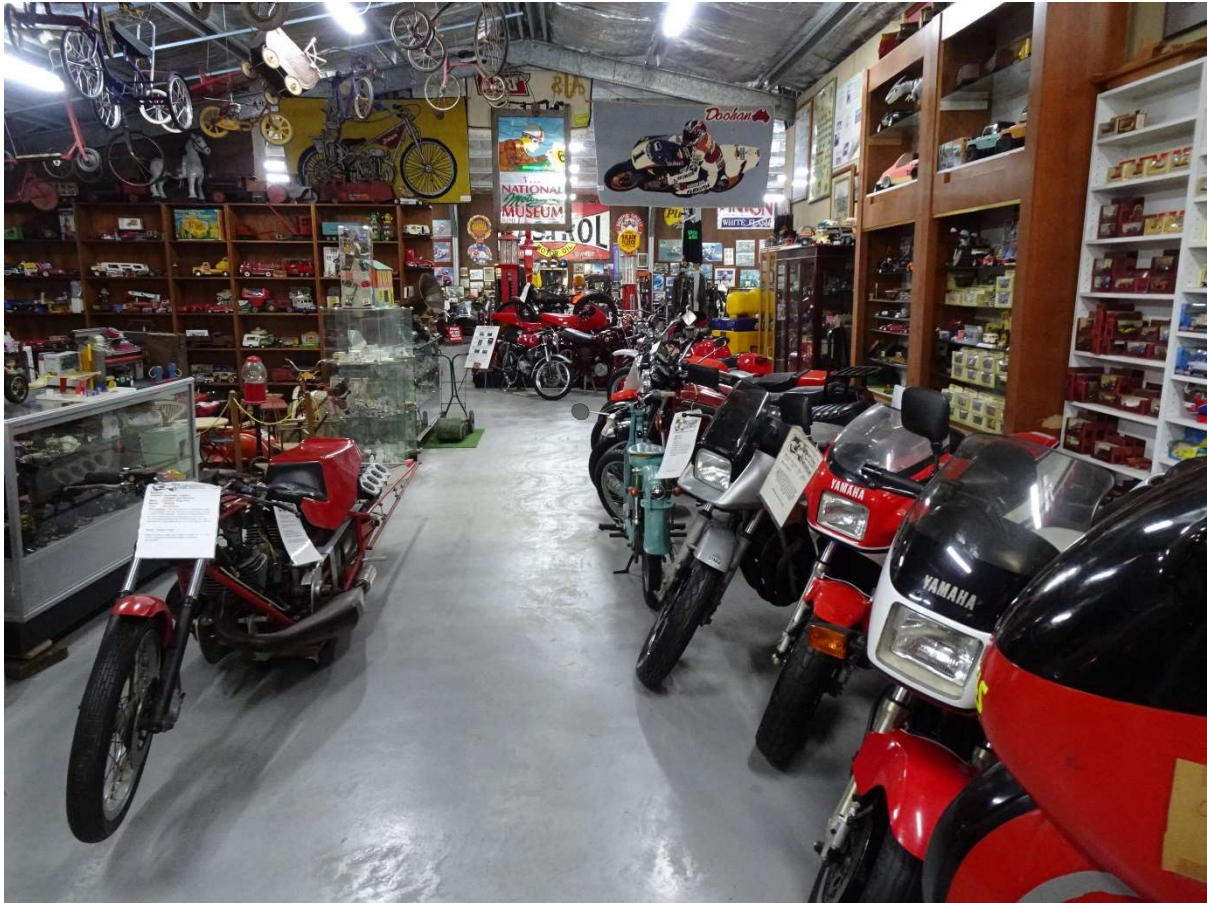
The internationally renowned National Motorcycle Museum of Australia Is located at Nabitac