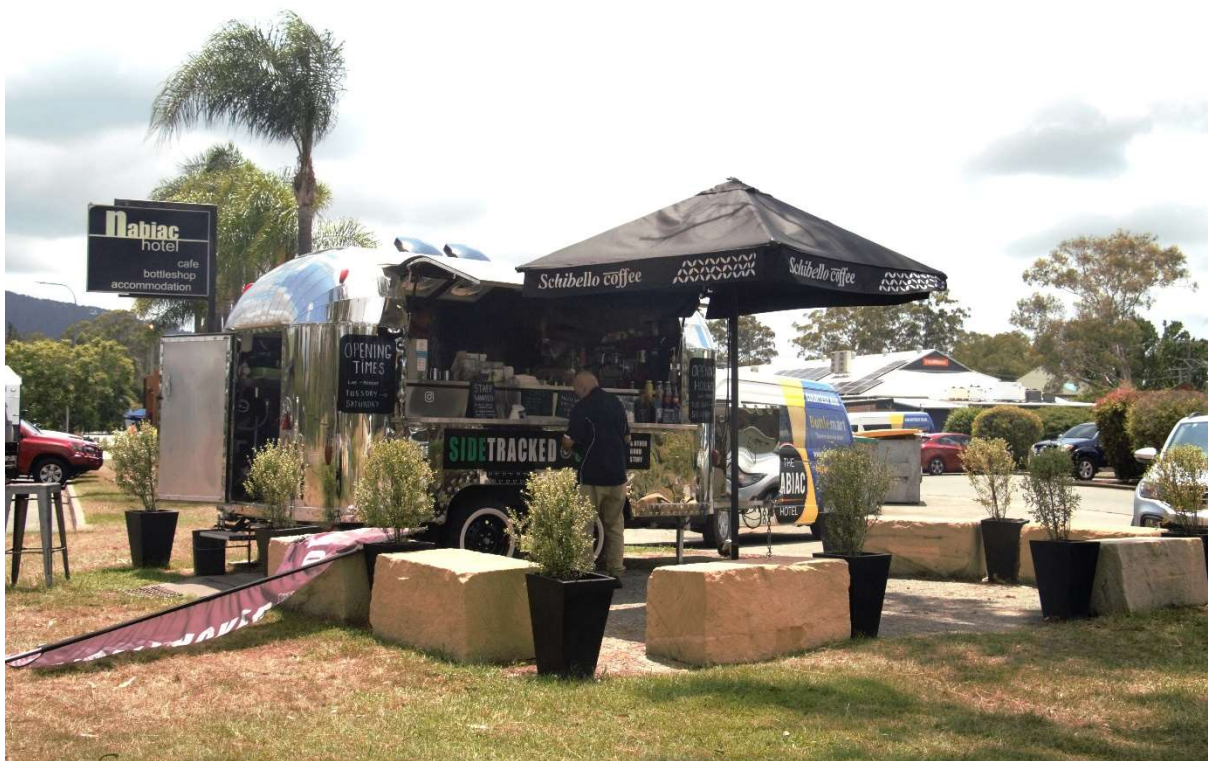
Coffee on the run