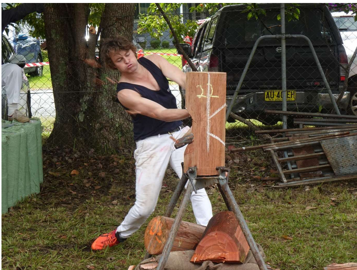
Woodchopping is a crowd favourite at the Wallamba District Show