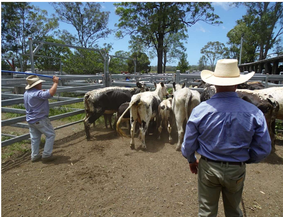
Monthly cattle sales