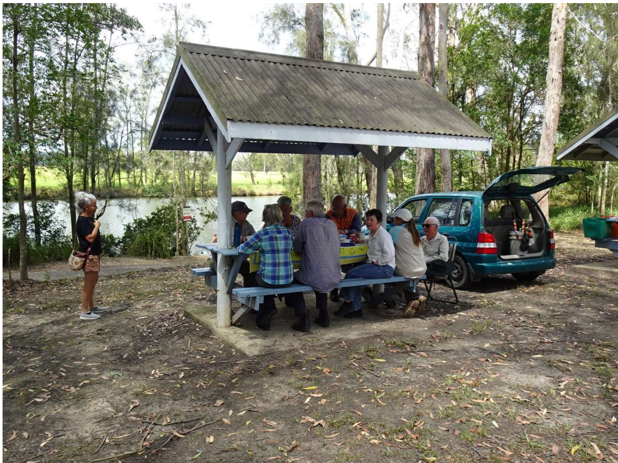
Riverside picnic on the banks of the Wallamba River

It is important that older residents be able to continue living in the community they know, with support from family, friends, local medical practitioners, support services and regular visiting medical specialists. There is a choice of purpose-built retirement or aged care facilities within our catchment area. A regular bus service to Forster or Taree is available if needed.